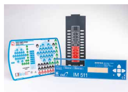
Synthetic front panels/layers